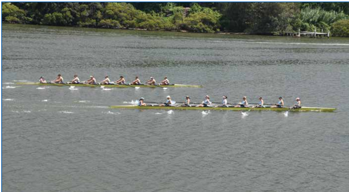
Sydney Rowing Club winning the Women's Gold Cup at Riverview Regatta 2024.